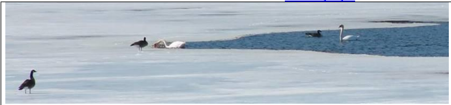
Paul Holland captured a special visit by migrating swans as the ice broke up on Cranberry Lake

...and check out events calendar and local resources at www.seeleysbay.ca