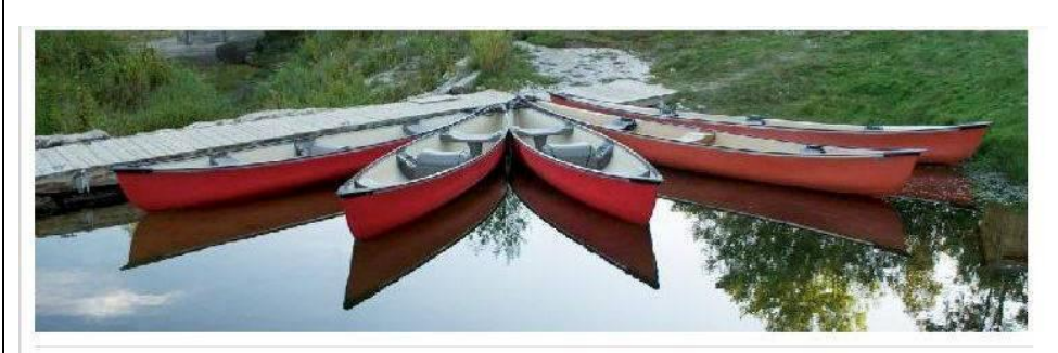
Watch for ongoing updates at www.redcanoefest.com