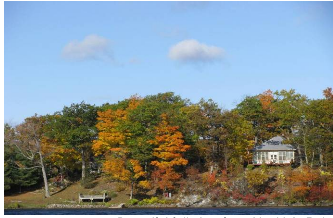
Beautiful fall view from Haskin's Point

What are your views on what should be done to improve the quality of life in Seeley's Bay? Survey results will be compiled and highlights published in a future issue of the newsletter.